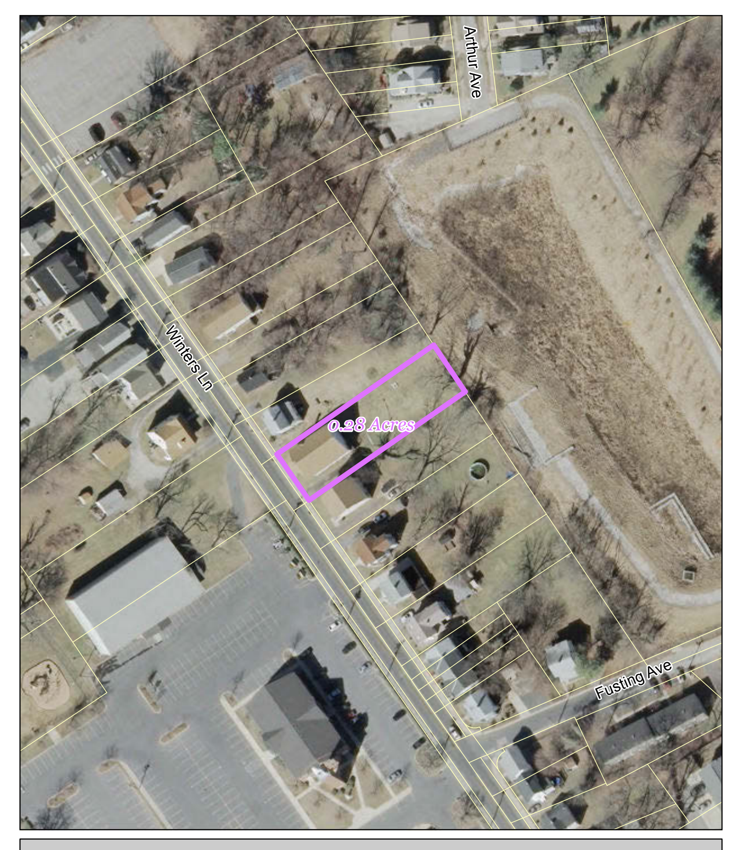
Historic Environmental Setting for Landmark Lodge No. 40

Historic Environmental Setting Parcel Boundary